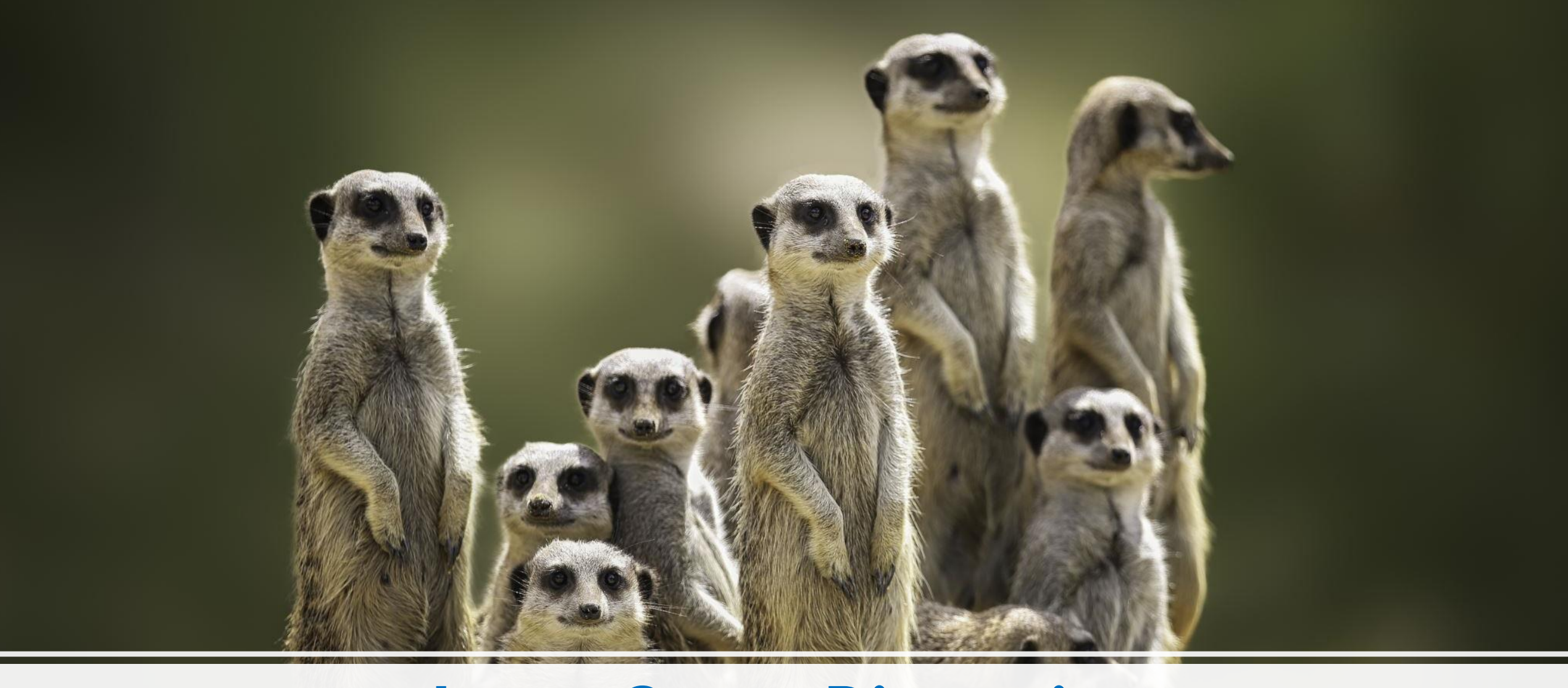
Large Group Discussion