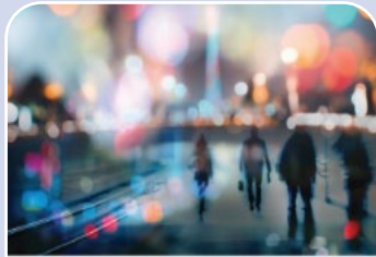
Stimulant Use Disorder