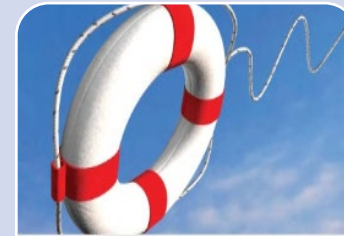
Overdose Education & Naloxone Distribution (OEND)