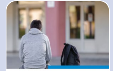
Substance Use Disorder (SUD) Harm Reduction