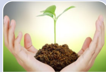
Alcohol Use Disorder (AUD)