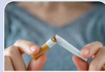
Tobacco Use Disorder (TUD)