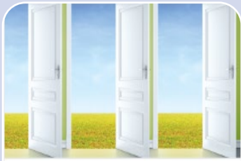
Opioid Use Disorder (OUD)