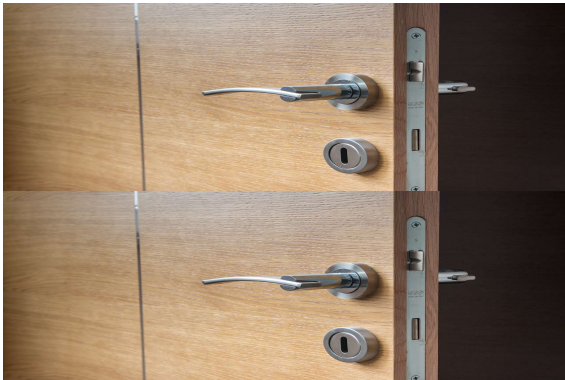
“Getting In the Door”